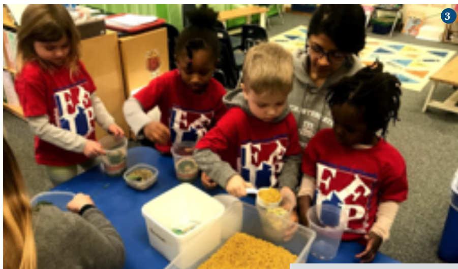
(3) The cold temperatures did not stop our community from coming together for our annual MLK Day of Service! With the help of parent volunteers, PK3 students prepared dried soup mix jars for a local food pantry.