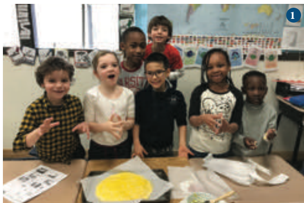
(1) First grade students weren't afraid to get their hands dirty while making a traditional galette des rois. (2) Eighth graders suited up before entering a lab while visiting Drexel University's College of Medicine.